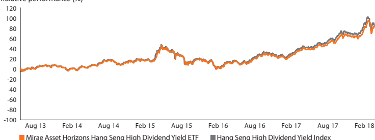
Cumulative performance (%)