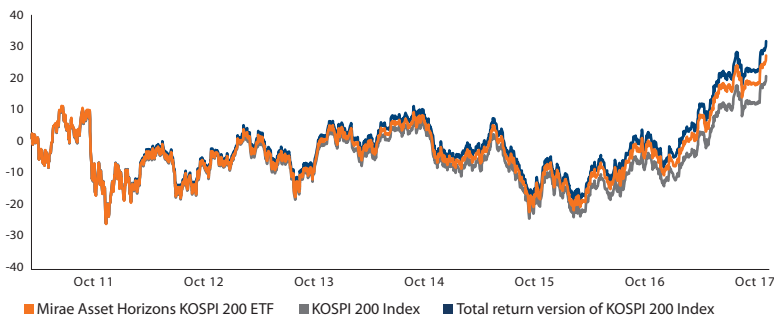
Cumulative performance (%)