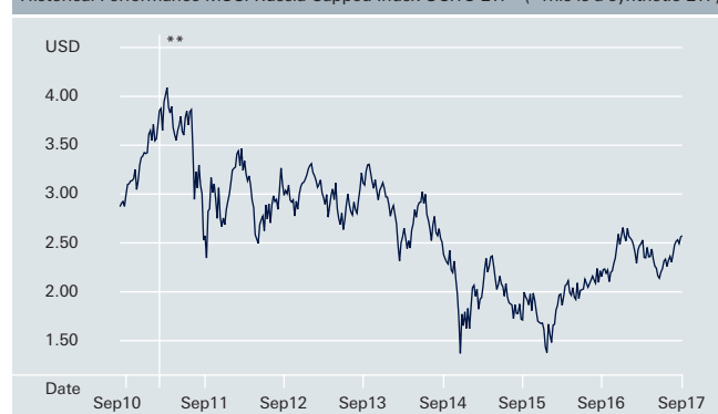
Historical Performance MSCI Russia Capped Index UCITS ETF* (*This is a synthetic ETF)

Past performance is not a reliable indicator of future results. ETF performance is calculated in USD on a NAV to NAV basis with dividends reinvested, if any. Index performance calculated on a total return basis. ETF performance calculation includes reinvested dividends. **See note on page 1.