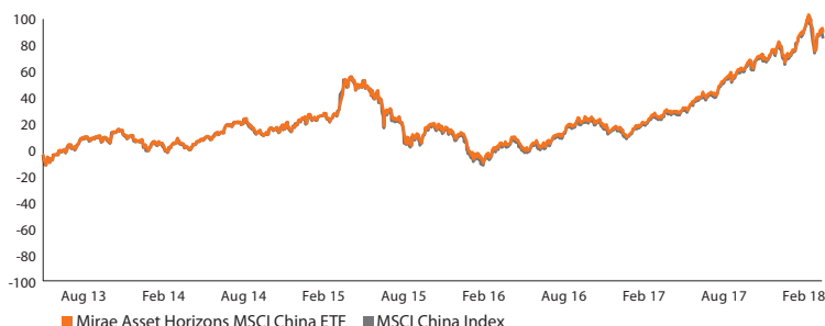
Cumulative performance (%)