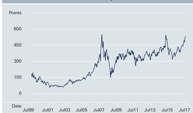
Historical Performance MSCI China TR Net Daily USD Index