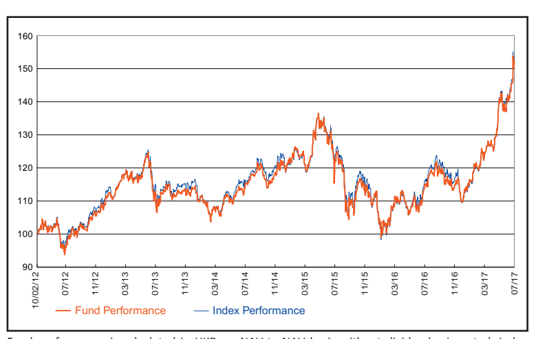
Fund performance is calculated in HKD on NAV-to-NAV basis without dividend reinvested. Index performance is price return.