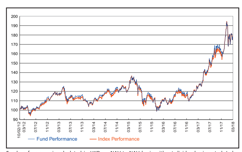
Fund performance is calculated in HKD on NAV-to-NAV basis without dividend reinvested. Index performance is price return.