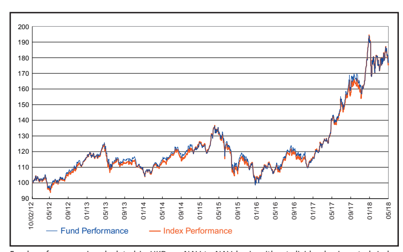
Fund performance is calculated in HKD on NAV-to-NAV basis without dividend reinvested. Index performance is price return.