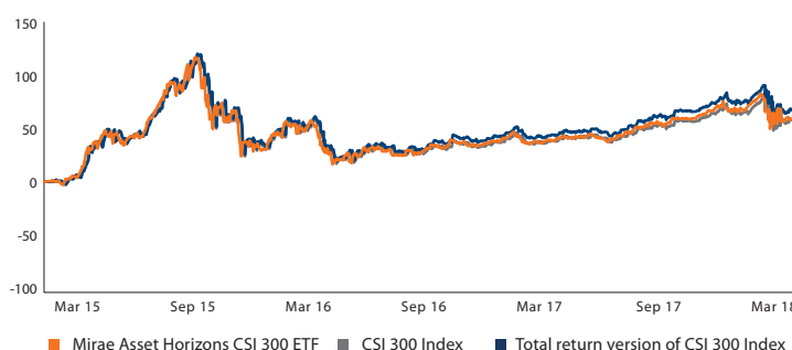
Cumulative performance (%)